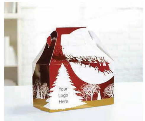
DONUT S1-01106 COOKIE S1-02106 CANDY S1-04106