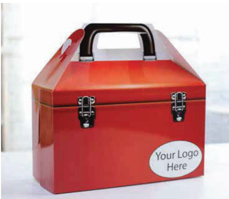
DONUT S1-01104 COOKIE S1-02104 CANDY S1-04104