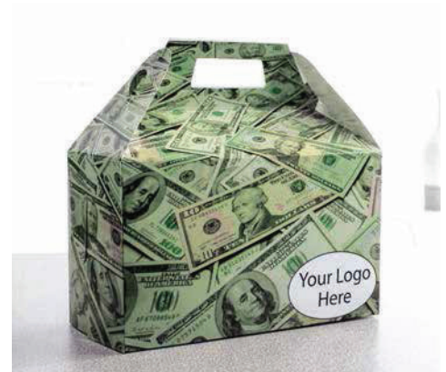
DONUT S1-01103 COOKIE S1-02103 CANDY S1-04103