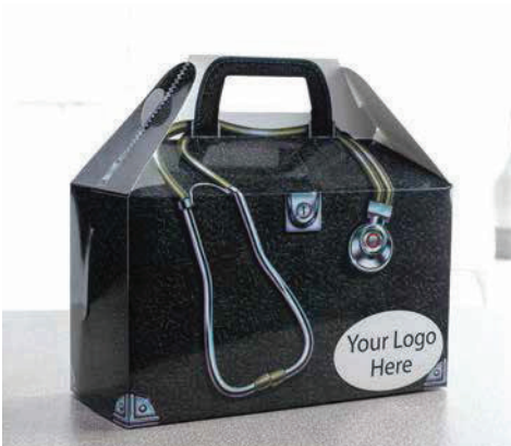
DONUT S1-01101 COOKIE S1-02101 CANDY S1-04101

If you don't have the time or resources to create custom graphics, our stock designs offer beautiful quick-turn solutions.