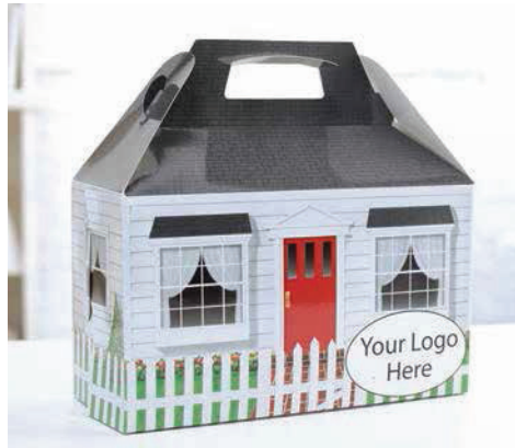
DONUT S1-01102 COOKIE S1-02102 CANDY S1-04102