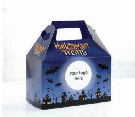
DONUT S1-01109 COOKIE S1-02109 CANDY S1-04109