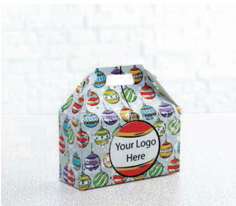
DONUT S1-01108 COOKIE S1-02108 CANDY S1-04108