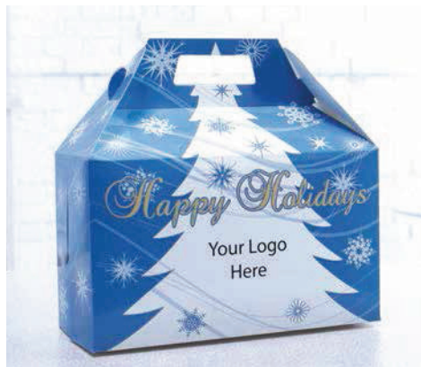
DONUT S1-01105 COOKIE S1-02105 CANDY S1-04105